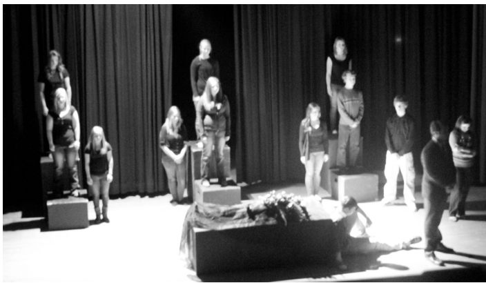
Above: Students in the One Act Play "Fatality" perform during the drinking & driving assembly on April 10th.